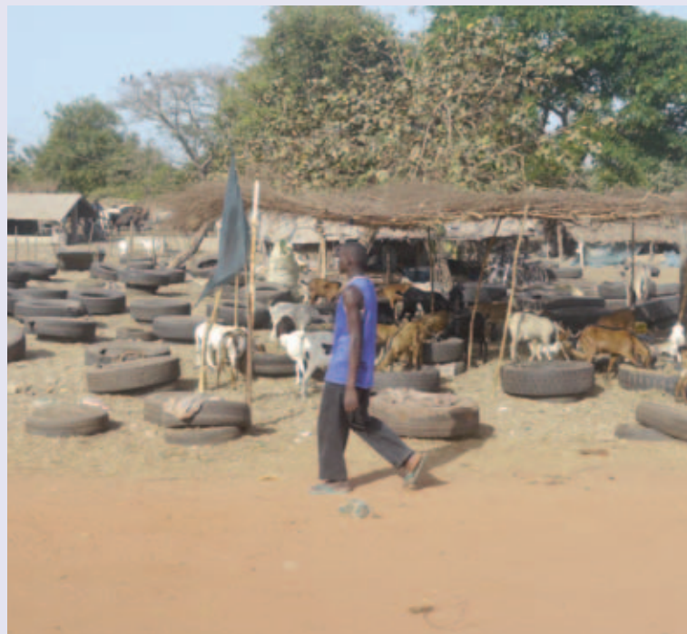
Goat herding in the suburbs of Brikama

We already have buildings, power supply, appliances, medication, and equipments. What we are lacking are committed people, who would like to help with the medical care.