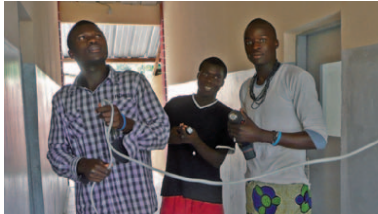
Locals help in setting up the equipment in the new building