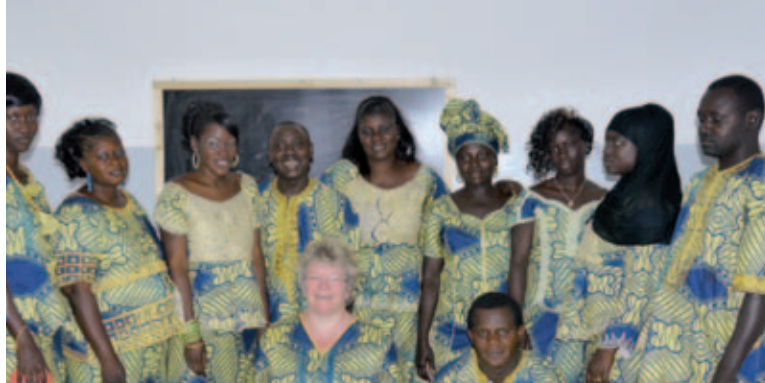
The staff at the health centre showed up for the celebration in the traditional wear