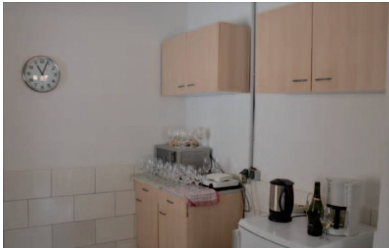
The furnished kitchen in the new wing