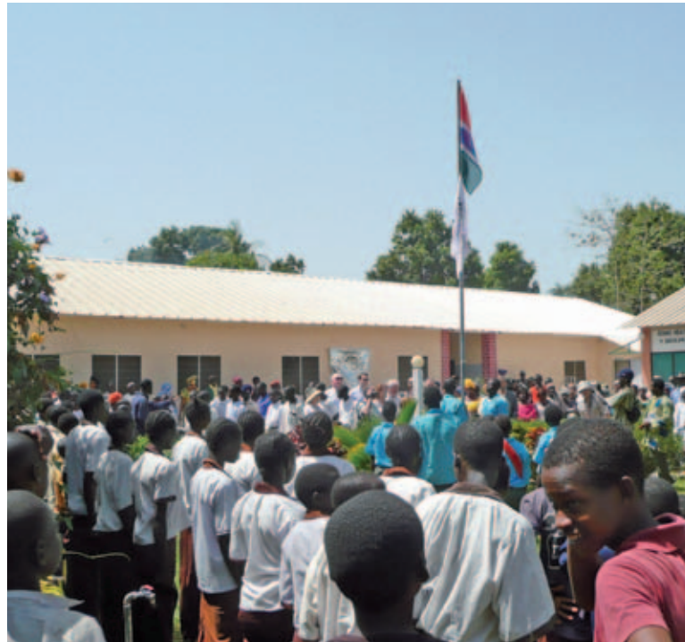
The new building behind the opening ceremony